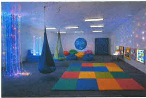
Sensory room for exercise and/or calming anxiety